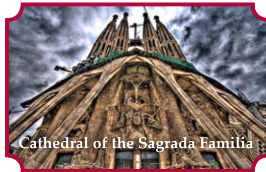
Cathedral of the Sagrada Família

we will participate in the Blessed Sacrament Procession and the Candlelight Procession.